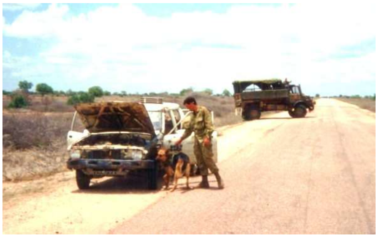
Sapper Seamus Doherty and EDD Mick perform a vehicle search at an impromptu Vehicle Check Point (VCP). Note the Unimog in the background acting as a "cut-off". Somalia 1993.