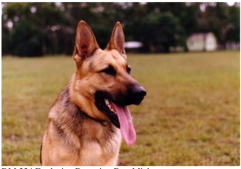
DM 334 Explosive Detection Dog Mick.